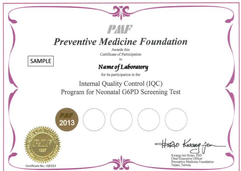
Fig. 2. Certificate of Participation.